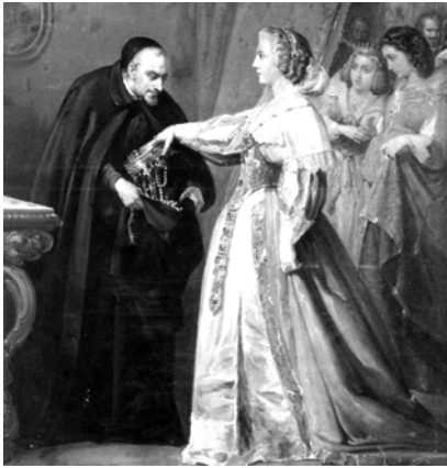
Queen Anne of France donates her crown and jewels to St. Vincent de Paul.

items, have them valued and begin the process. In addition to helping one of our area's oldest charities, you'll also earn a tax break. We ask you to keep this project in your prayers and to share your blessings with those in need by taking advantage of this golden opportunity.